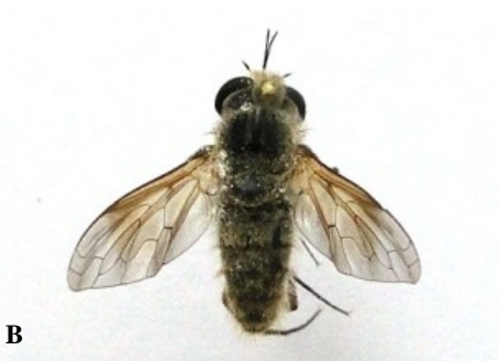
Fig. 1. Callostoma oezbeki: (A) left wing, (B) adult male.