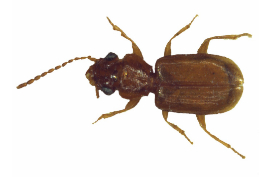
Figure 5. Perileptus jelineki sp. n., habitus, dorsal view.

Sexual differences – Female with dense short light erected hairs on elytra, and scarce short light erected hairs along marginal sides of pronotum, temples and supraorbital area of the head. Elytra dull, transverse microsculpture distinctly visible.