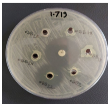
Figure 2. A representative selection of antibacterial activity of the isolates against K. pneumoniae (ATCC 700603)

Of the 40 molecularly confirmed isolates, 6 (15%) demonstrated antibiotic activity against the tested pathogenic bacteria (Figure 2). All six isolates (100%) displayed antibacterial activity against drug-sensitive P. aeruginosa and K. pneumoniae . Five isolates (83.3%) were active against both drug-resistant and drug-sensitive S. aureus . However, none of the isolates showed activity against drug-resistant A. baumannii or P. aeruginosa .