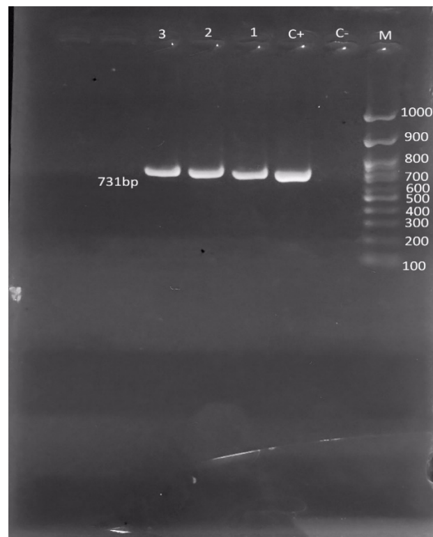
Figure 3. Gel electrophoresis showing the 731 bp PCR products from B. melitensis -specific primers (Br.m)

International studies corroborate our epidemiological observations. In Brazil, Keid et al. (2015) found a B. canis seroprevalence of 20.9% in 753 dogs, with no significant association between sex and infection status [21], a pattern that was mirrored in our results ( P=0.76 ). Conversely, a statistically significant association between Brucella infection and dog type ( P=0.013 ) highlighted herding dogs as a high-risk group due to continuous exposure to infected ruminants.