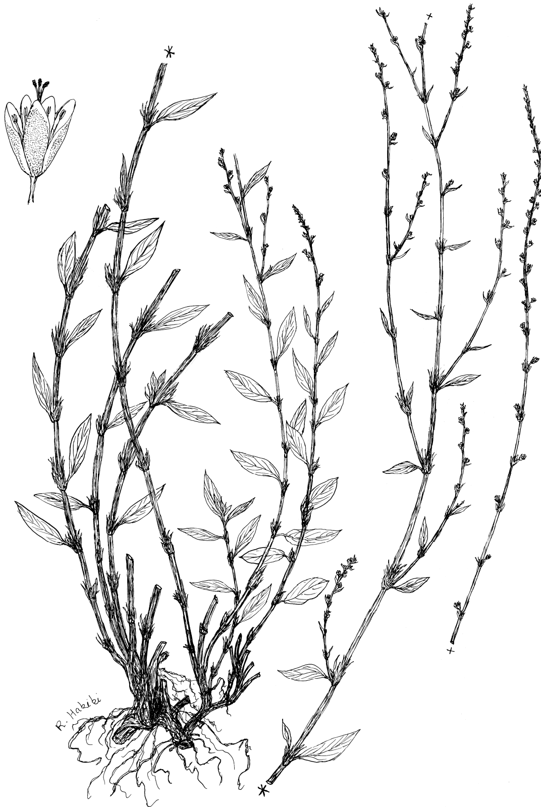
Fig. 1. Polygonum iranicum ( \times 0.5 ); flower ( \times 5 ).