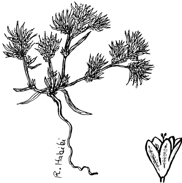
Fig. 4. P. molliaeforme ( \times 1 ); flower ( \times 10 ).

Sabzkuh, Mozaffarian 97418 (TARI); Semnan: Chastkhokhoran, 1620 m, Riazi, 3842 (TARI); Tehran: Shemshak, Dizin, 3000-3500 m, Mozaffarian and Mohammadi 49075 (TARI); Arak, Mountains above the village Latedar, 2100-2600 m, Assadi 75054 (TARI).