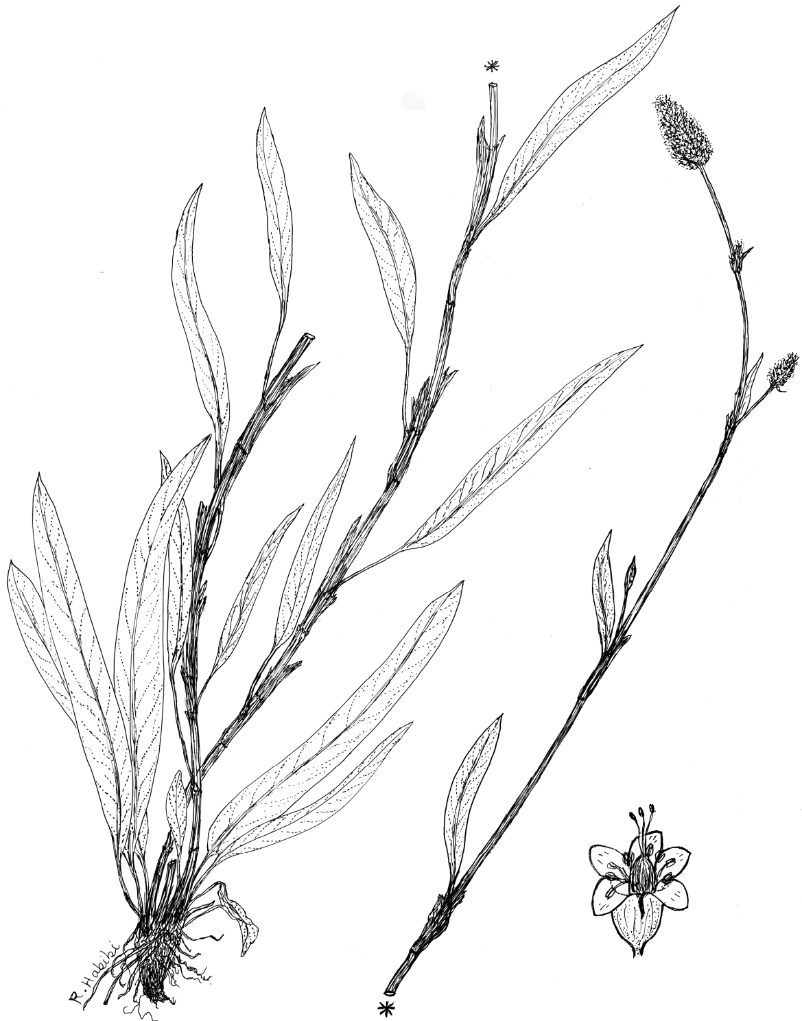
Fig. 5. Bistorta major ( \times 0.45 ); flower ( \times 4.5 ).