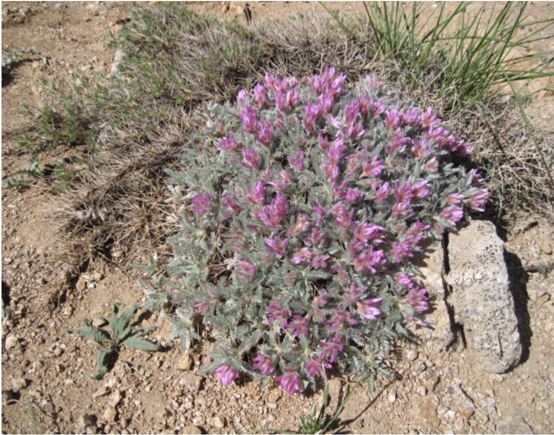
Fig. 2. Habit and flowering habitat of Astragalus leucargyreus .