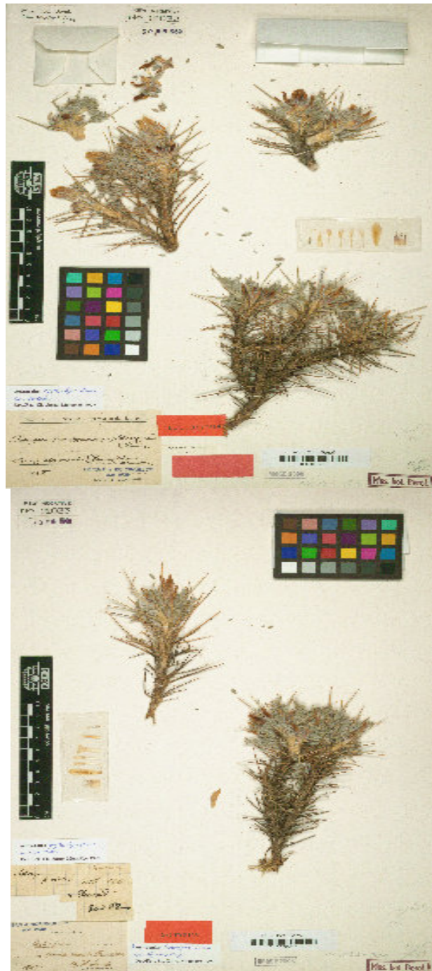
Fig. 1. Astragalus leucargyres (Type specimens from Berlin Herbarium).

type collection, we prefer not to regard it as a synonym of a distinct species. But, rather to put it in exploration programs.