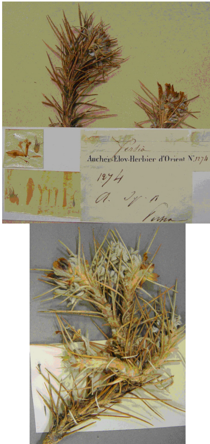
Fig. 4. Astragalus erythrolepis (type specimen from G-BOIS Herbarium).

Podlech, D. 1999: New Astragali and Oxytropis from North Africa and Asia, including new combinations and remarks on some species. -Sendtnera 6: 135–174.