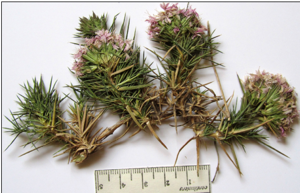
Fig. 1. Acanthophyllum ejtehadii Mahmoudi & Vaezi – 44247 (FUMH).

Section Oligosperma with 23 species worldwide is the largest section of the genus, of which 16 species occur in Iran. This section was firstly described by Shishkin (1936) in Flora of USSR. The members of the section are identified by dense flowers, spherical terminal heads, (4) 6-12 mm long calyx, 1-2 mm long calyx-teeth and 4-ovuled ovary (Shishkin 1936, Schiman-Czeika 1988). Generally, variation of morphological characters within the family of Caryophyllaceae makes the taxa complicated to be delineated and identified (Fior & al. 2006). In Acanthophyllum species, like other Caryophyllaceae genera, there are specimens with doubtful position.