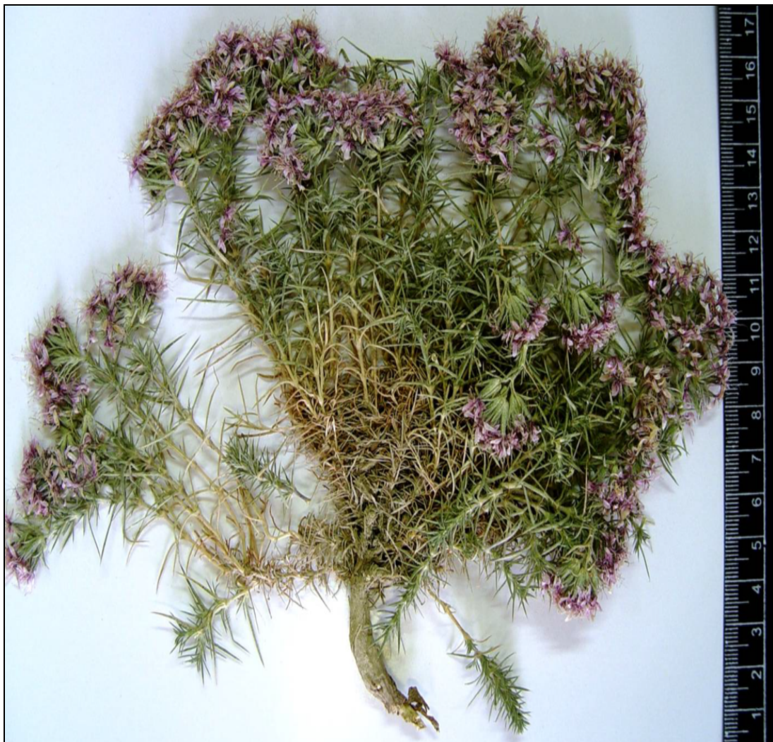
Fig. 2. Acanthophyllum maimanense Rech. f. & Schiman-Czeika – 34612 (FUMH).