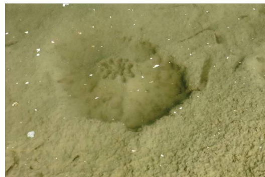
Figure 3: Nesting pattern of Iranocichla hormuzensis males on shallow bed margin of Tang-e-Khor River (Hormuzgan Province)

zigzag and were oblique) to attract females and specimens of females (in light color) were also seen around.