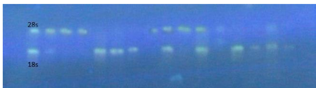
Figure 1: RNA quality assessment extracted from liver and muscle of H. huso on agarose gel(1.5%);in all samples two clear bands 18S and 28S of rRNA clearly observed (eight bands on the left are from liver and the others are from muscle).