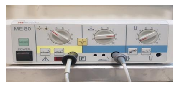
Figure 1. Electrosurgery unit (Bovie machine)

Electrosurgery Unit and Animal Preparation. The electrosurgery unit (Bovie machine; Figure 1) used in this study was KLS Martin ME 80 (KLS Martin Group, Germany). This unit has three main parts, including 1) monopolar electrodes (Surgi-pen; Figure 2) attached to a needle electrode with 0.4 mm outer diameter to make an incision in the skin, 2) rubber neutral electrode for children (8×16 cm; Figure 3) with a single contact surface of 120 \text{cm}^2 , and 3) monopolar double-pedal footswitch (Figure 4). Several serious precautions should be followed while performing electrosurgery as a preferred surgical method. To avoid animal burning it is necessary to ensure that the animal back skin is fully connected to the rubber neutral electrode; therefore, before putting the mouse on the rubber neutral electrode, it is required to cover the back skin with a water-based lubricant.