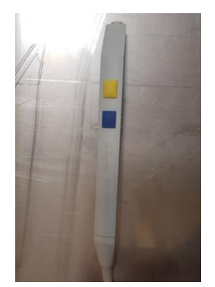
Figure 2. Monopolar electrodes (surgi-pen) equipped with cut and coagulation switch