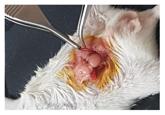
Figure 5. Vas deferens

Electrosurgery. The surgi-pen was plugged into the Bovie machine. Before setting up the electrical flow rate and frequency, the needle electrode was connected to the surgi-pen. Then the device was turned on, and the yellow pedal was pushed on the footswitch. In this step, a close contact is made between the needle electrode and shaved skin in the medial line of the (for detailed procedure abdomen see the supplementary video). A 10 mm longitudinal skin incision was performed about 1 cm above the penis. After making 1 cm incision in the abdomen skin and body wall, the testicular adipose pad of one side was grabbed with micro-dissecting serrated forceps and pulled to expose testis, then the vas deferens was cut (Figure 5).