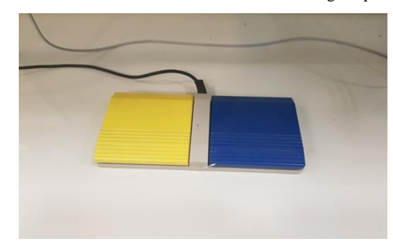
Figure 4. Monopolar double-pedal footswitch; yellow pedal (cut); blue pedal (coagulation)