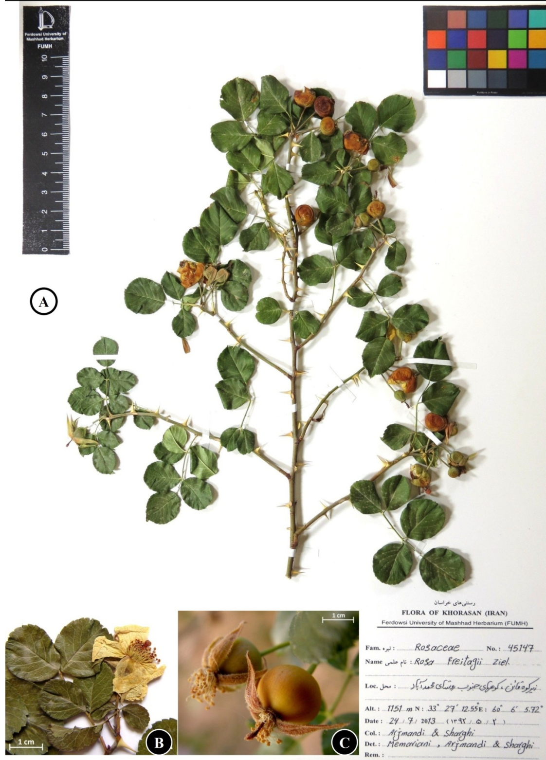
Fig. 1. Rosa freitagii Ziel. A, Herbarium specimen (45147, FUMH). B, close-up view of herbarium specimen (30860 FUMH) showing the flower, columnar style, prickles and round shape of the leaflets; C, Early fruiting stage in natural habitat (45147 FUMH) showing the entire sepals and columnar shape of styles.