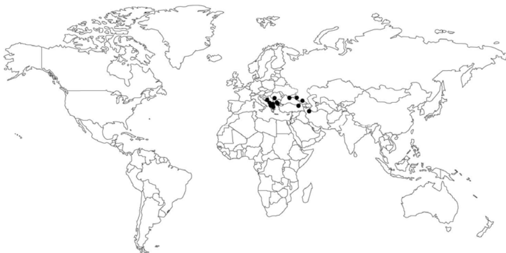
Map 1. Geographical distribution of Luzula taurica .

Syn.: Luzula italica Parl., Fl. Ital. 2: 309 (1857); Luzula spicata var. italica (Parl.) Rouy, Fl. France 13: 267 (1912); Luzula spicata f. italica (Parl.) H.Lindb., Acta Soc. Sci. Fenn., n. s. B 1(2): 37 (1932); L. stilbocarpa Kirschner & Křisa, Preslia 51: 336 (1979).