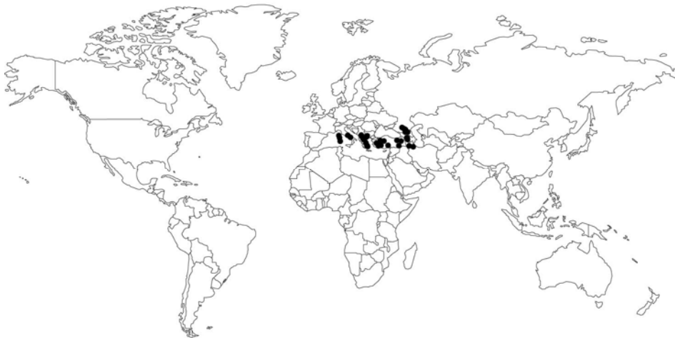
Map 2. Distribution of Luzula spicata subsp. italica .